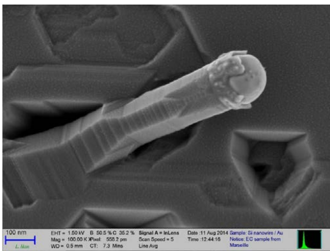
Figure 1. In-lens SE detector image of a Si NW clearly showing different facets and its fine structure on the surface. The surface sensitive imaging at 1.5 kV reveals highly resolved crystalline facets on the Si NW.